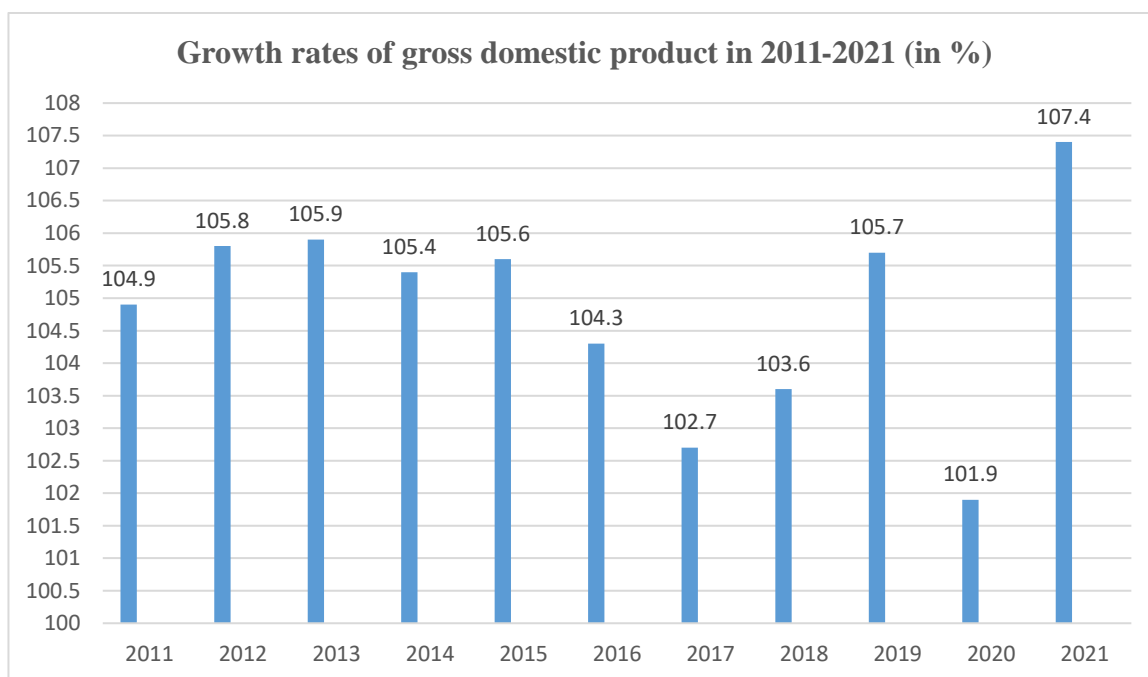
1-picture. The growth rate of gross domestic product per capita in the Republic of Uzbekistan in 2011-2021 years, of percent 2 .

In 2017, 54.9 million dollar were invested in the country's research and design work. This is more than in 2010 year 3,6 times. With the creation of innovative products in the Republic of Uzbekistan, 37 thousand people are employed, 32 thousand of them are researchers. The scientific potential of the researchers is currently 40 percent of the aging population. This indicator has a growing trend, which is widely supported by the state [19].