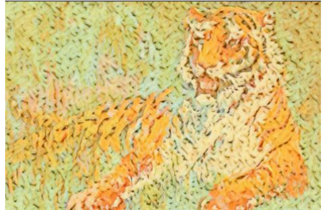
Style Transfer Example: Style Image: A picture of cooked pasta

To create a new texture based on a white noise image, we use gradient descent to find another image that fits the Gram-matrix representation of the original image. In this optimization, the mean-squared distance between the entries of the original picture's Gram matrix of the image being generated is minimized.