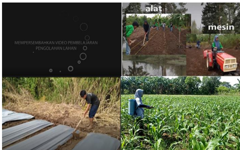
Figure 3. One of the pictures is the result of developing learning video

Do activities encouraged project groups to work in teams who thought creatively and worked innovatively. The results were the development of applicable instructional videos that were able to be used as teaching media by teachers of agriculture vocational schools. The scenario of do activities in blended learning was started with greeting to motivate students in learning. Given that do scenario was the continuation of absorb scenario, the activities in do scenario had been formulated in the previous scenario. In developing the video materials and designs, each group had to be cohesive, cooperative, and creative so that each project group was able to work independently to discover video designs. Instructions in blended learning were to write assignments which were five project tasks with five different titles. In this part, the project groups were reminded to make sure whether the schedule to complete the projects was corresponding to the deadline.