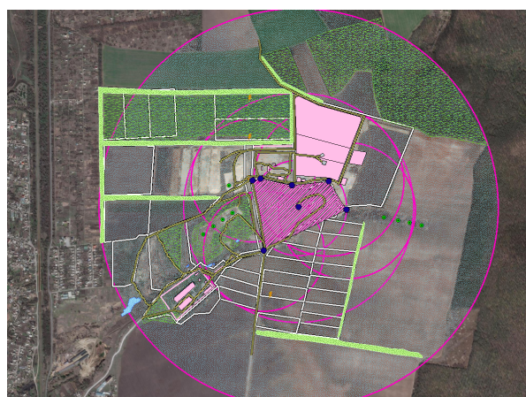
Fig. 3. Sanitation and protection zones were built to economic buildings and the nearest settlements on the territory of the Dergachyv solid waste landfill

It should be noted that this is far from the only thing that can be done thanks to the geodatabase and. Its possibilities depend on the quantity and quality of available information, which can be used by specialists in this field.