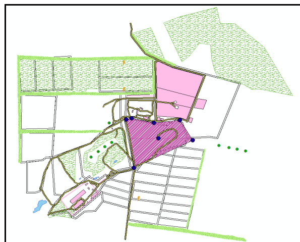
Fig. 2. Vectorized territory of the Dergachyv solid waste landfill (Kharkiv, Ukraine)

Also, with the help of a vectorized map, it is possible to automate the calculation of areas of sanitary zones.