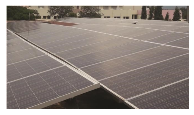
Fig. 4. On-grid solar power plant at Karunya Institute of Technology and Sciences-Part B.

In Fig. 2, the mounting position and tilt angle is clearly seen. Similarly, Fig. 3 and Fig. 4 shows the commercially working solar PV plant at Karunya Institute of Technology and Sciences.