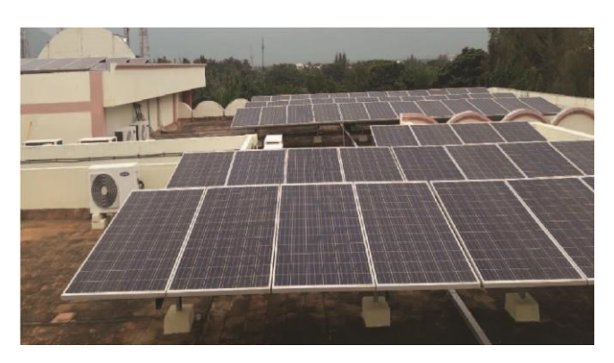
Fig. 3. On-grid solar power plant at Karunya Institute of Technology and Sciences -Part A

4th International Conference on Electrical Energy Systems (ICEES)