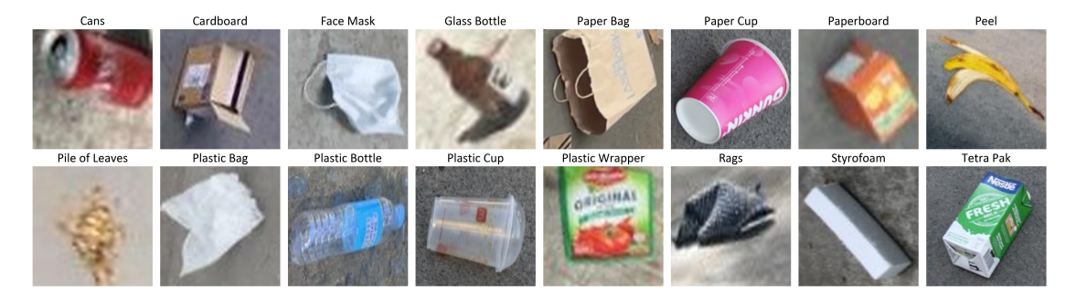
Fig. 3: Examples of the waste objects considered in this study