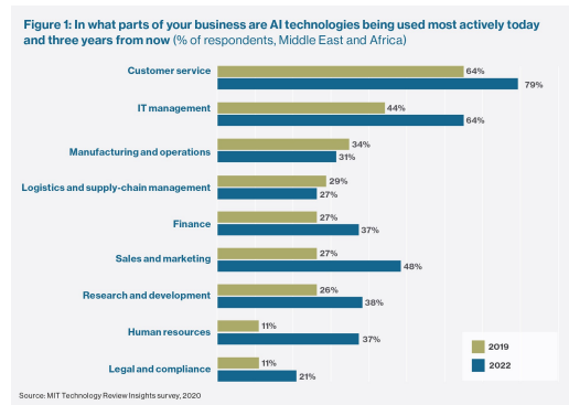
Figure 4: on AI adoption areas in Middle east and Africa

runners typically outweighs the greater transition costs and possible penalties associated with early adoption in this scenario.