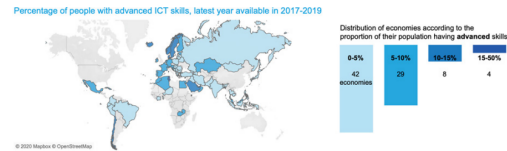
Figure 3:

by purpose. This assists in locating possible "lighthouse" and "pilot" use cases that could pave the way for the company's AI aspirations. Such prominent and early use cases are crucial to success because they encourage the adoption of AI throughout the firm. The technologies and organizational requirements will be determined after the broad vision and specific use cases have been established