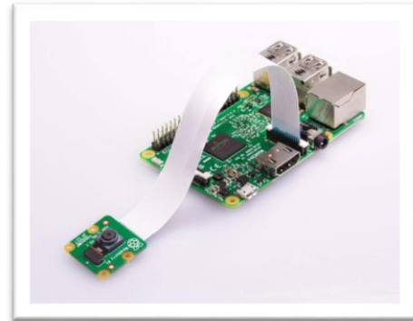
Figure 1 “PI with Camera Module”

i.e virtual cart screen as well as the web application's POS in real-time.