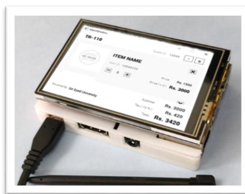
Figure 3 “Cart Screen”

As we needed to design a system for the virtual cart which could act user friendly because the customer would have to use that system so the customer must not face any difficulties with scanning the product, reviewing the bill being made, selecting and removing the desired items i.e using the application on the screen, so we designed a small box-typed system having Raspberry Pi and a touch screen connected with it which could easily be fixed in front of the cart.