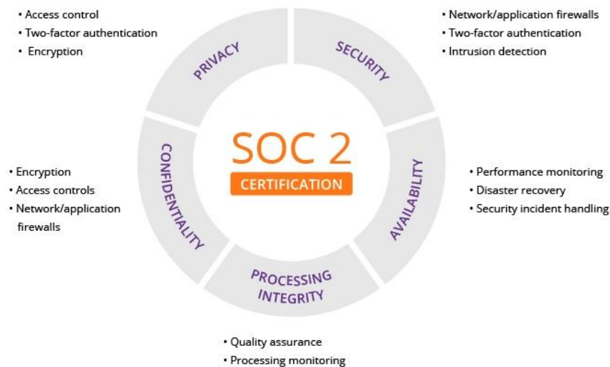
Fig. 2. Standards for System and Organization Controls (SOC)

Furthermore, as online stores work with different shapes of installment, cloud suppliers must comply with PCI prerequisites.