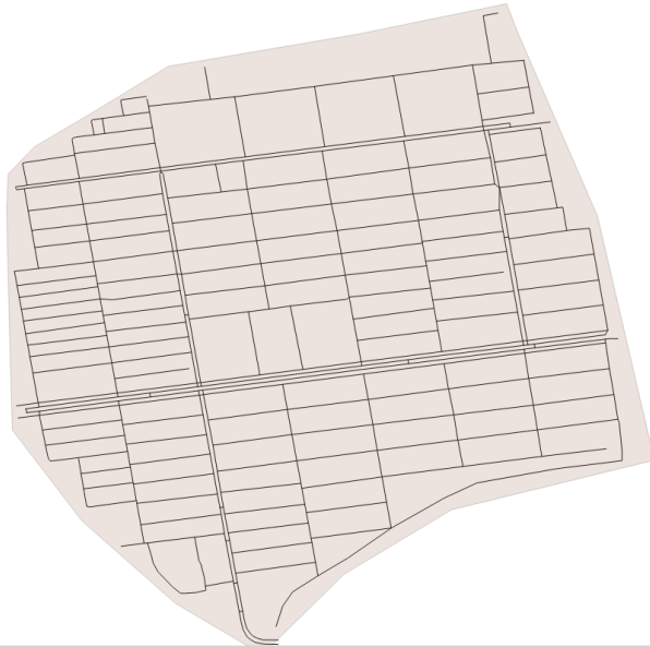
Figure 2: Phase 6 Hayatabad Pakistan