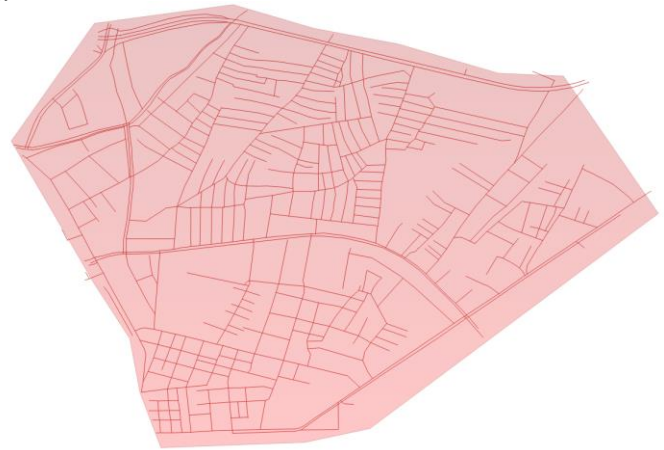
Figure 1: Shakirabad Peshawar Pakistan