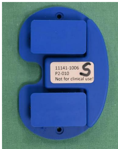
Figure 1: The DLB device (from above)

Using an electronic device for measurement is an advanced option to improve patient satisfaction after total knee arthroplasty. Like the studies of other existing devices have shown before there is a massive change in the kinematic behavior of the muscular abilities by using these tools for a better soft tissue balance. The DLB system is another option by showing 3 different measurement results (pressure, distance and joint angle) to adapt the implantation procedure to the individual situation of the patient. It is a time efficient tool without an extension of the surgical time, simple to handle and easy to use.